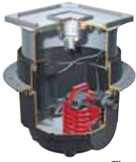
Fig. shows status up to model year 12/2010