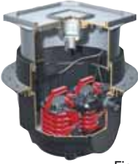
Fig. shows status up to model year 12/2010