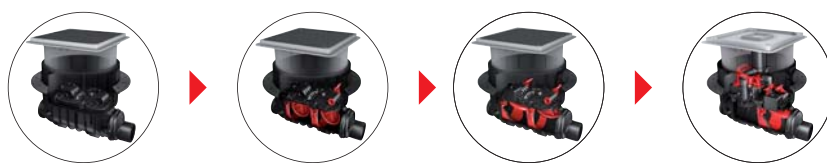
Clean out Controlfix

Within the complete series, all backwater protection components from the drain body / clean out Controlfix to the Pumpfix F backwater valve with integrated pump can be retrofitted easily later into the installed chamber, without tools being necessary.