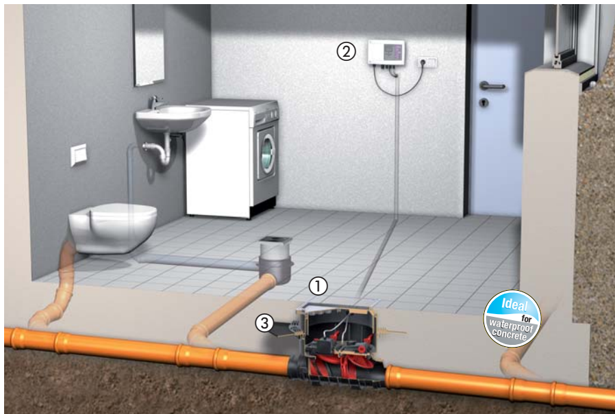
① Backwater valve ② Control unit ③ Sealing gasket set

Backwater valve Staufix FKA as central backwater protection for the simple and professional installation through the installation set provided. For toilets, showers, sinks and washing machines that are located in the basement. In the event of backwater from the sewer, the valve is sealed by a motor driven backwater flap and then opened again afterwards. Regular and automatic functional testing by the SDS system integrated in the control unit. The sealing gasket set Art. # 83023 makes installation in waterproof concrete possible.