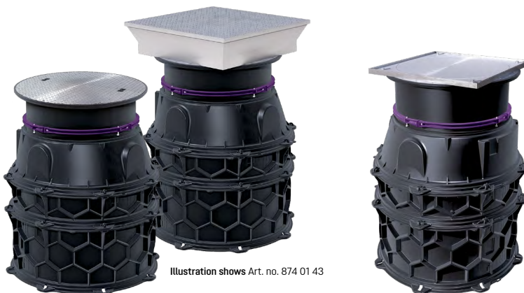
Illustration shows Art. no. 874 01 43

Note: Additional installation depths, upper sections and covers class B/D (on request)