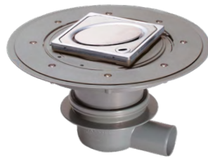
Illustration shows Art. no. 40 150.54 with Lock & Lift locking system

Design cover Oval 120×120 mm and rim made of stainless steel AISI 304, for tile thicknesses 8 – 21 mm, class L 15; standard slotted cover 95×95 mm made of stainless steel AISI 304, for tile thicknesses 6 – 14 mm, class K 3 or slotted cover 138×138 mm and rim made of stainless steel AISI 304, for tile thicknesses 8 – 16 mm, class L 15