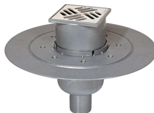
Illustration shows Art. no. 40 250.90

Slotted cover 100×100 mm in stainless steel AISI 304, class K 3