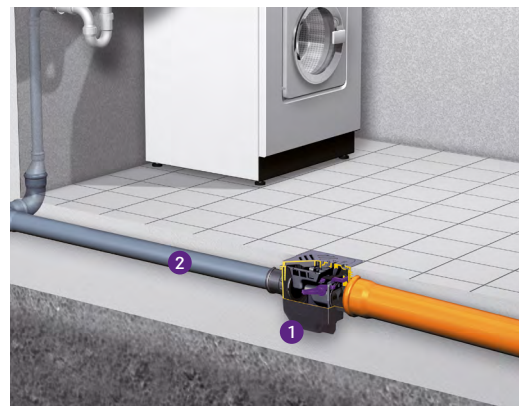
1 Drain 2 Inlet

The Drehfix is a basement drain with integrated, removable backwater valve (Type 5). In addition, it protects connected discharge points such as washbasins, showers or washing machines against wastewater from the sewer. With odour trap, sludge bucket, manually locked emergency closure and a discharge rate of 1.8 l/s, it can be used flexibly and is so compact that it fits in the recesses of old cast iron drains. It is therefore ideally suitable for renovation projects.