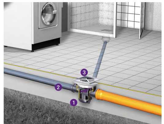
1 Drain 2 Inlet 3 Steel cover

It couldn't be more flexible. The Universal is a versatile basement drain for sewage free wastewater. It is equipped with a backwater valve and a manually lockable emergency closure. The Universal has three inlets as a standard feature (two in Ø 50 and one in Ø 75 mm), the telescopic upper section is also rotatable, tiltable and height-adjustable. This ensures it provides maximum flexibility for the design and installation. The Universal is optionally available with a slotted grating made of polymer or stainless steel.